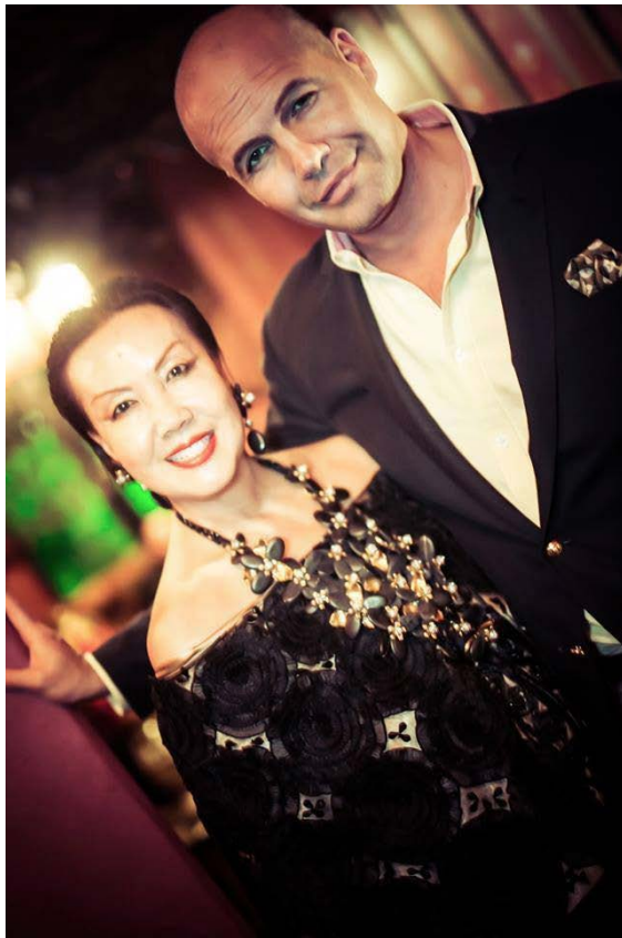
Sue Wong with Titanic Actor Billy Zane